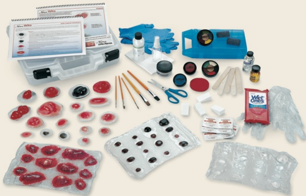
Life/form ® Basic Nursing Wound Simulation Kit (LF00793U)