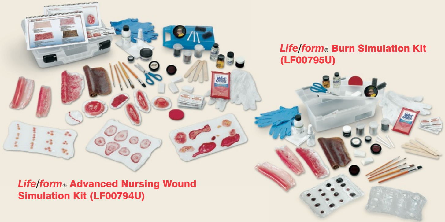
Life/form® Burn Simulation Kit (LF00795U)