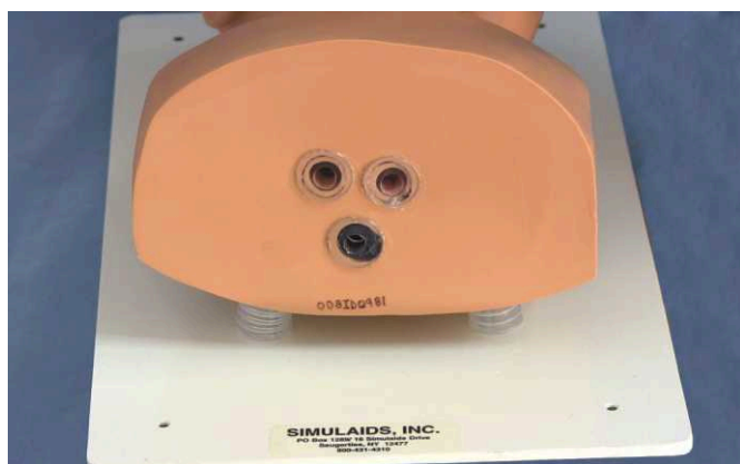
Lungs and stomach removed.

Use water based solutions to clean the trainer. Hot soap and water will take care of most dirt, but if they get grimy then use a commercial cleaner like 409. The airway can be swabbed out